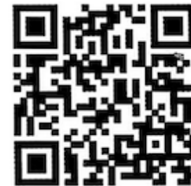
Parking Attendant QR Code

When guests park without registering—or when they park despite no available spaces—they may unintentionally displace residents who rely on street parking. Registering guests helps us manage this shared resource fairly and ensures that residents can continue to park in their own community.